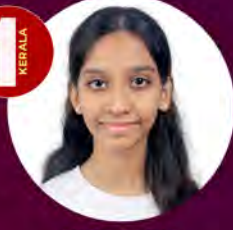
HIBA ZAINA UCEED 2026