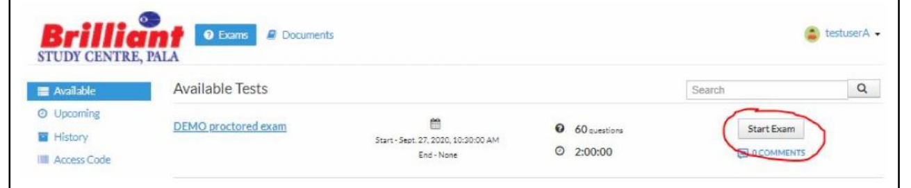
Step 3: Click on "Start exam" / exam title "IIT - AIIMS 2024 Screening Test" from "Available test" menu