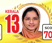
AIR - 182 HAMNA M T