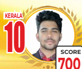
AIR - 157 DEVADATH